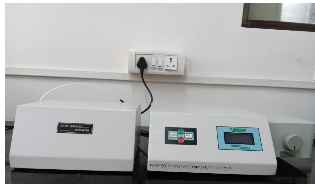
Karl-Fischer Auto titrator