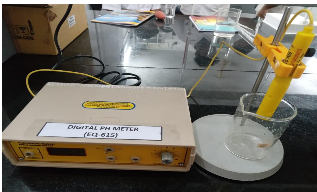
Digital pH meter