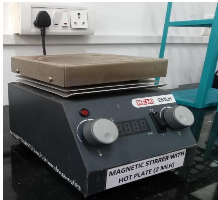
Magnetic Stirrer with Hot plate