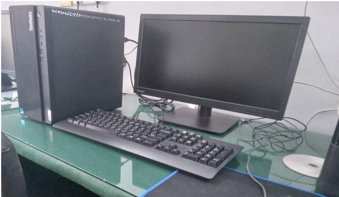
Desktop (Intel Core I3 Processor)