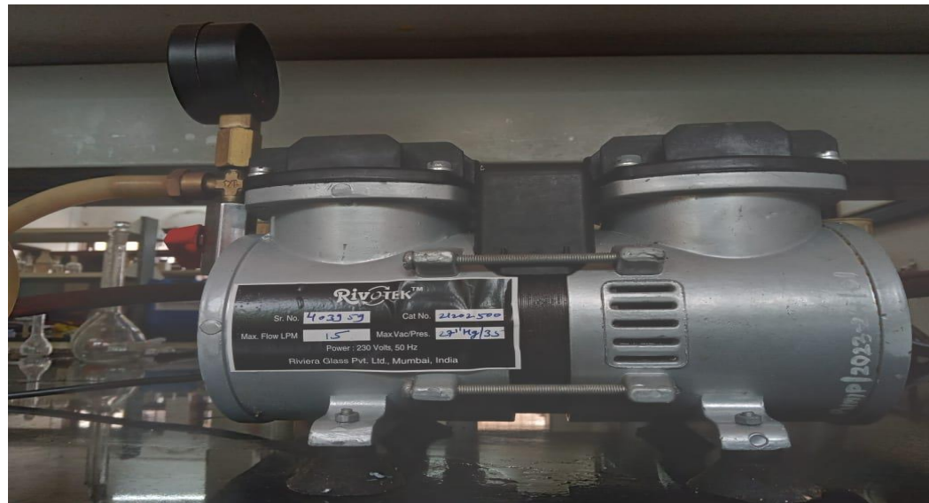
Portable Vacuum Pump