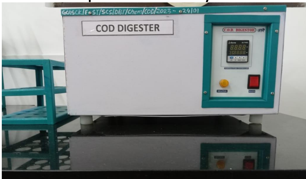
Chemical Oxygen Demand (COD) Digester