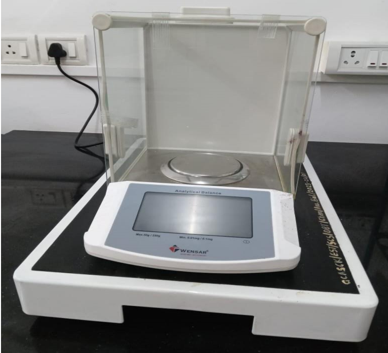
Semi-micro Weighing Balance